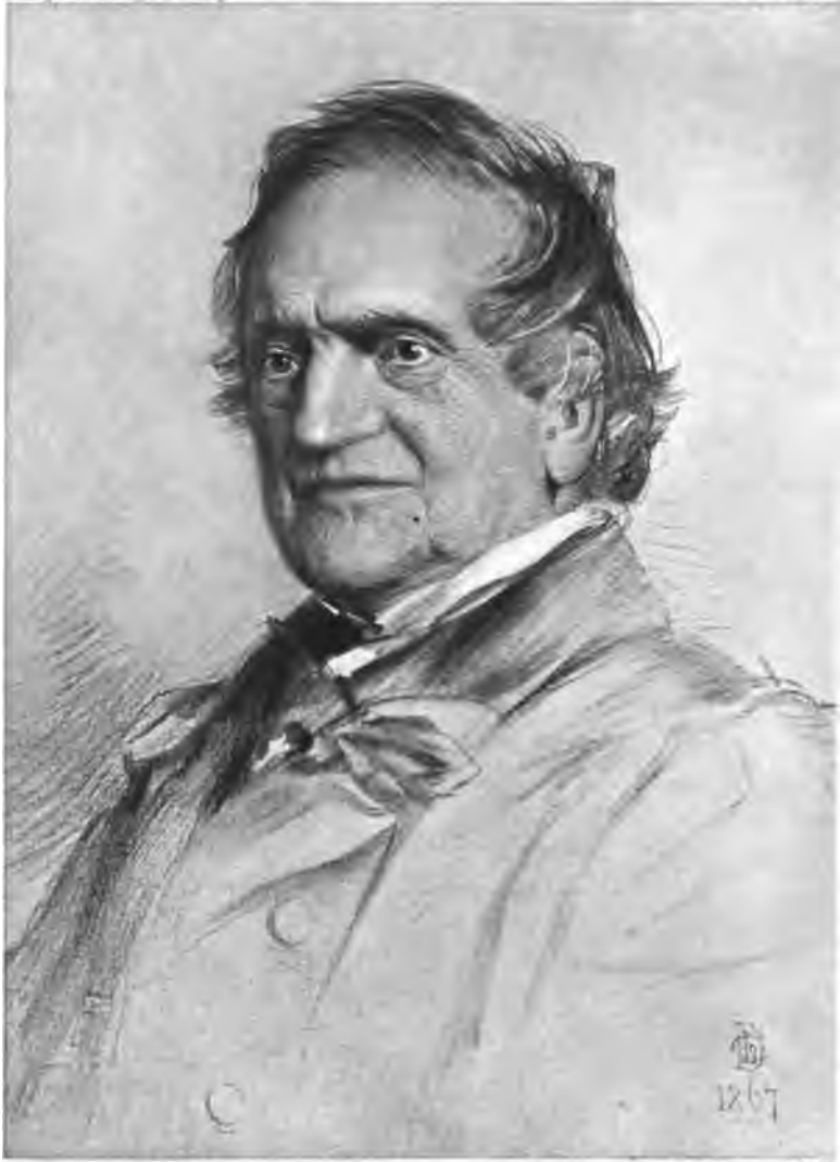
From Sketches of the Geologists of the Society

Adam Sedgwick D.C.L., F.R.S. President 1829-31