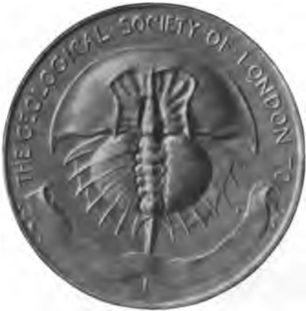
THE PRESTWICH MEDAL.