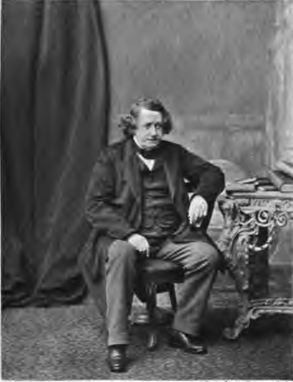
James Heath & Co. Glasgow