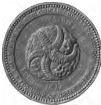
THE BIGSBY MEDAL.