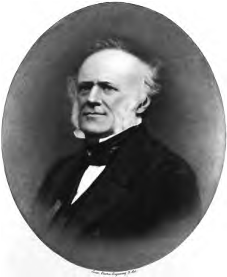
Sir Charles Lyell, Bart. D.C.L. F.R.S.

Secretary 1823-26 Foreign Secretary 1829-35 President 1835-37, 1849-51