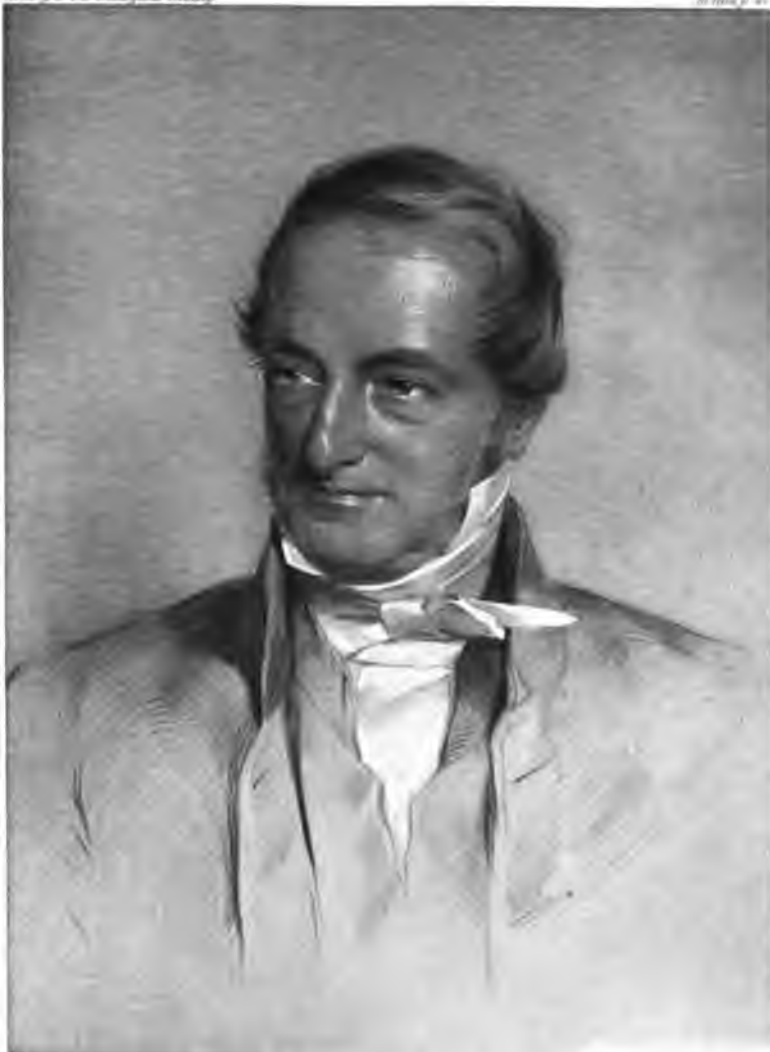
From Sketches Engraving 12 1.