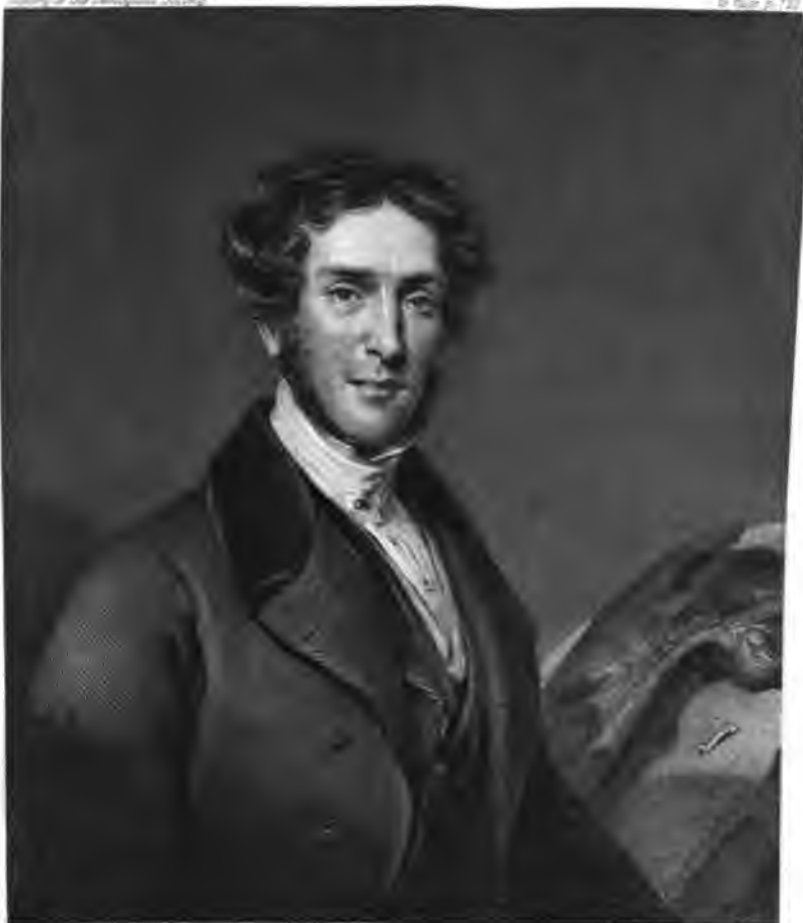
James Jackson Esdaile & Co. Ltd.