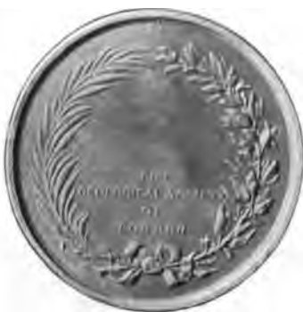
THE WOLLASTON MEDAL