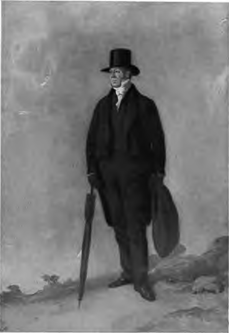
WILLIAM BUCKLAND, D.D., F.R.S.