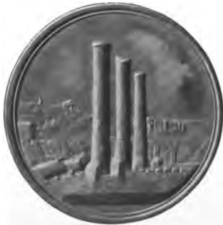
THE LYELL MEDAL.