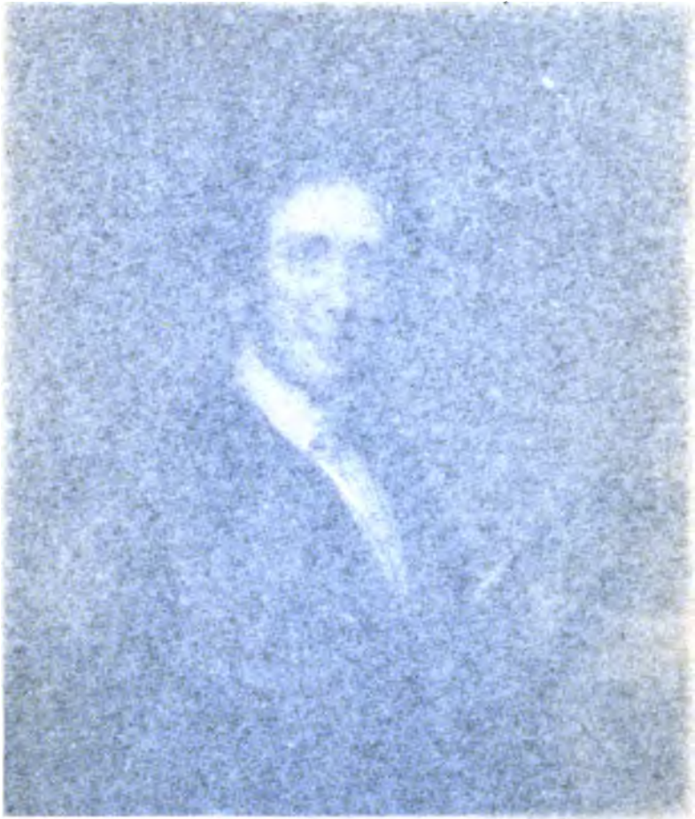
Portrait of [Name]