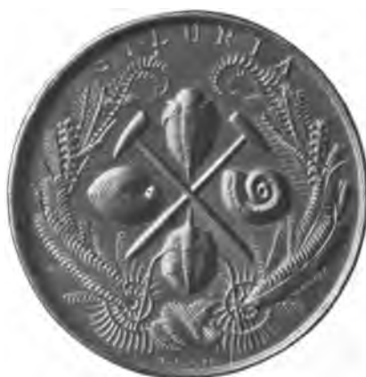
THE MURCHISON MEDAL.