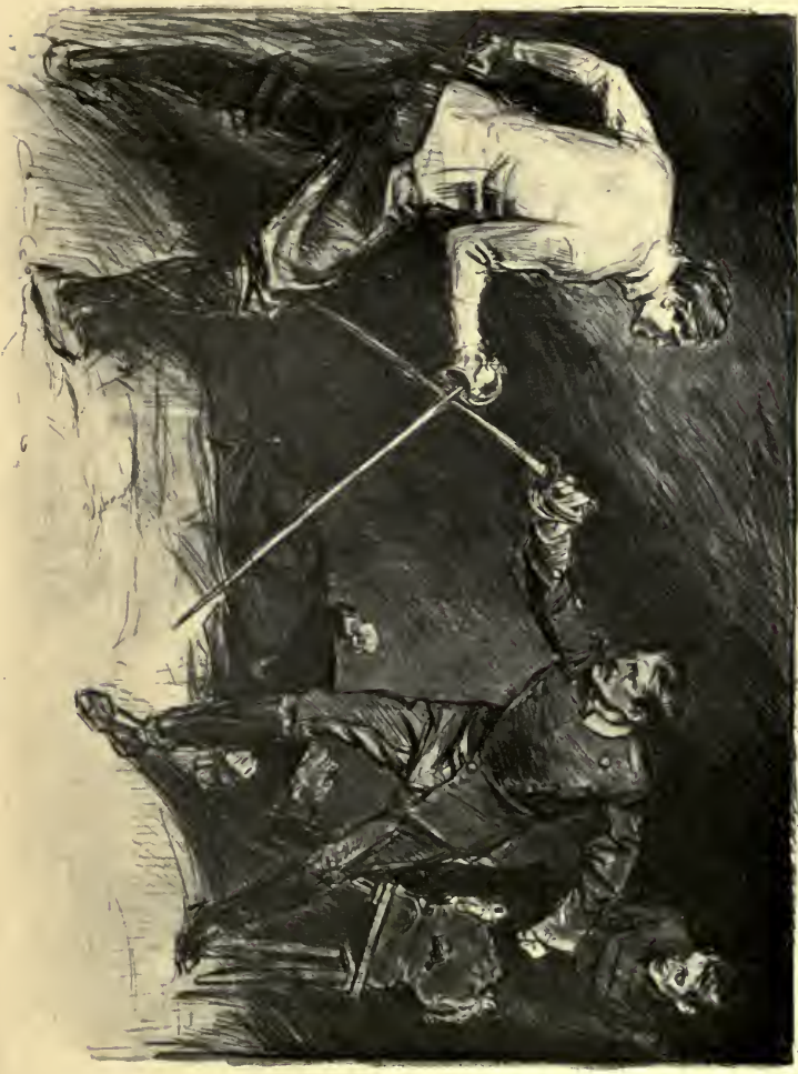
"COME ON! COME ON, MAN!"—Page 218.