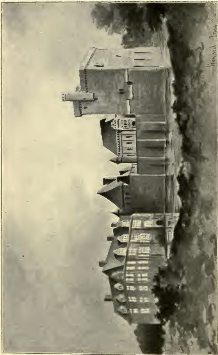
THE CASTLE OF ZENDA.