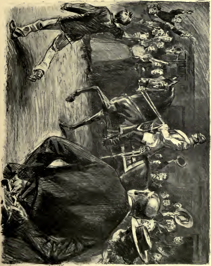
"IF HE'S RED, HE'S RIGHT!"—Page 61.