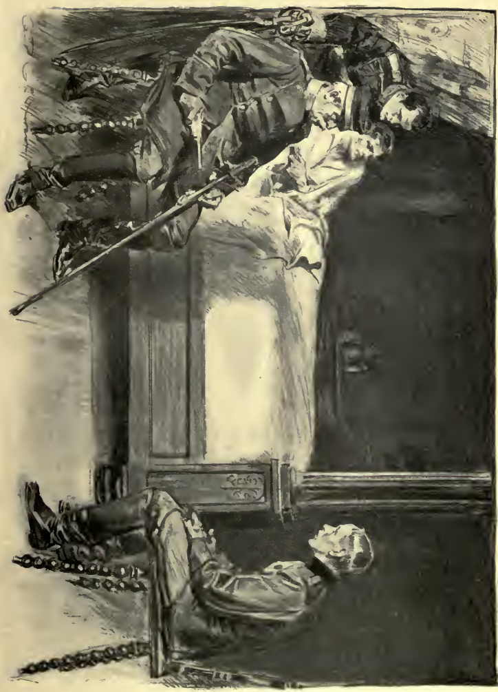
"THE FELLOW'S STORY WAS RUDELY TOLD."—Page 181.